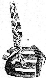
BACK SIDE VIEW