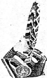
FRONT SIDE VIEW